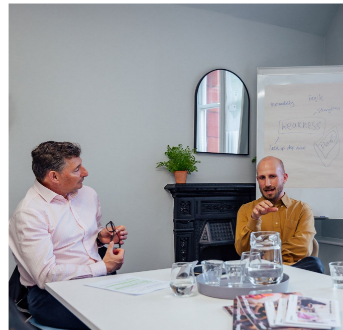
Gleeds Foundation Impact Report 2023/24 | 12